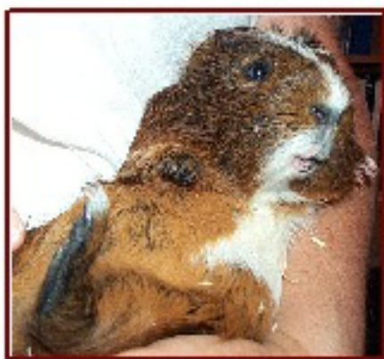
BEAVER HE'S A BIG BOY AND LKES TO SQUEAK A LOT.