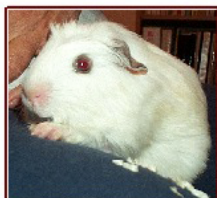
DARWIN QUIET AND CURIOUS.