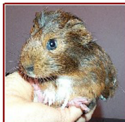
FREDDY MERCURY HE'S A ROCKSTAR FOR SURE!