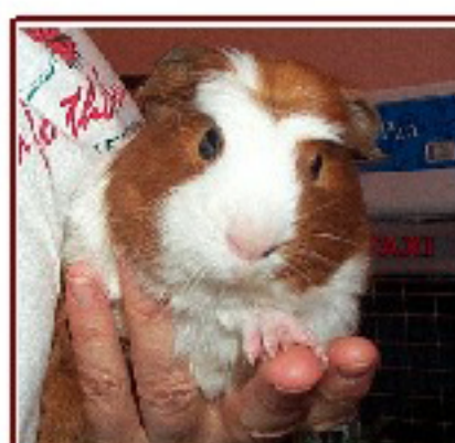
CAVENDISH HE KNOWS HE'S COOL!