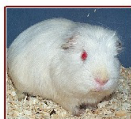
COURAGE COURAGEOUS AROUND THE BIGGER BOYS BUT HE'S NO WIMP - WHAT A SWEETIE PIE!