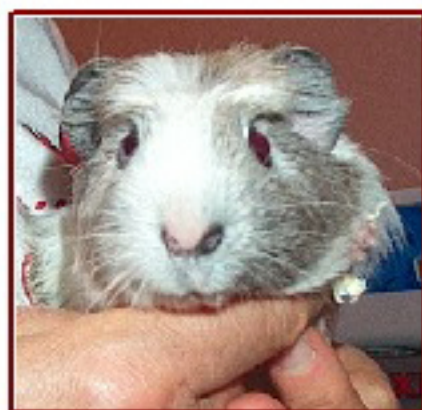
WINCHESTER TOO CUTE, GREY & WHITE, SMALL.